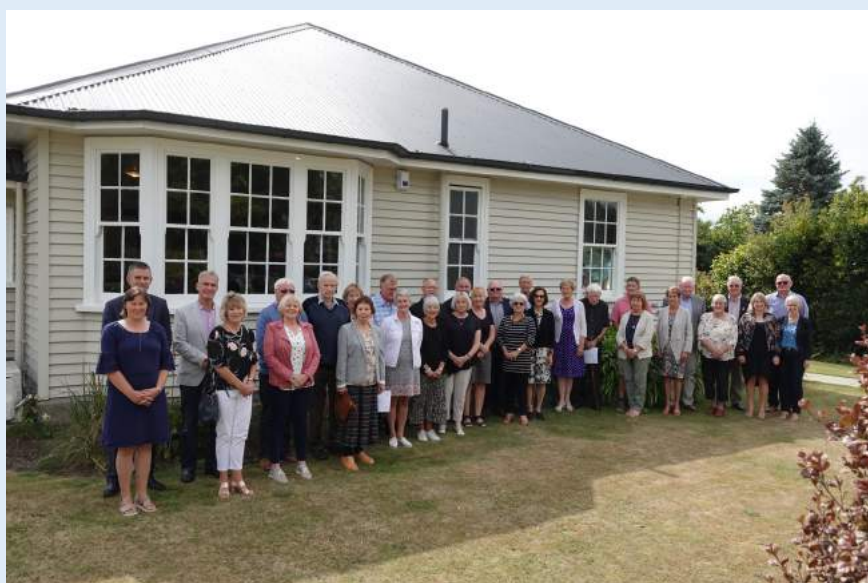
Hospice Mid Canterbury Foundation Group